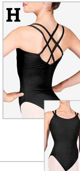
Cotton/Lycra Double Strap Leotard