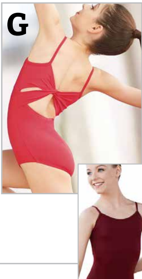
Nylon Twist Back Camisole Leotard