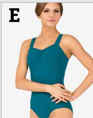
Cotton Pinch-Front Tank Leotard