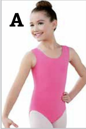
Cotton Tank Leotard