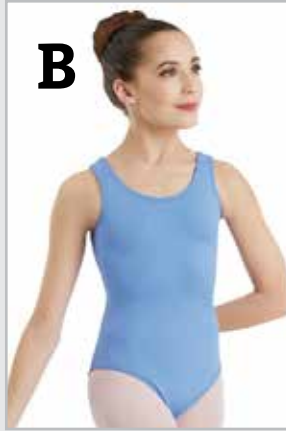
Nylon Tank Leotard