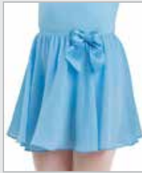
Bow Accent Skirt (optional)