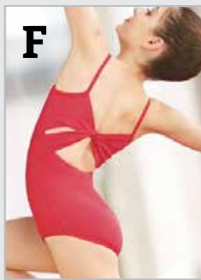
Nylon Twist Back Camisole Leotard